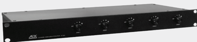
AT 5200 5-Channel 200W Audio Attenuator